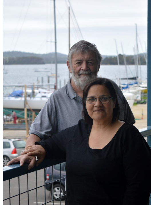
FOGGY MORNING PDYC