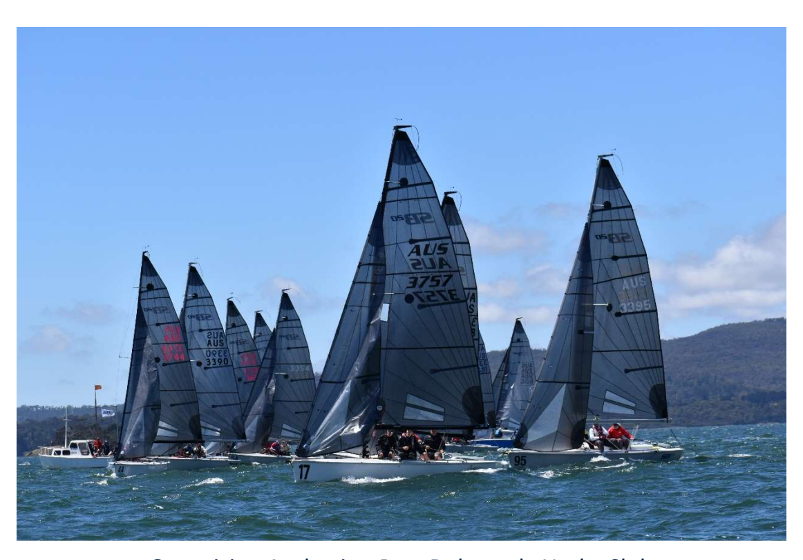
Organising Authority: Port Dalrymple Yacht Club